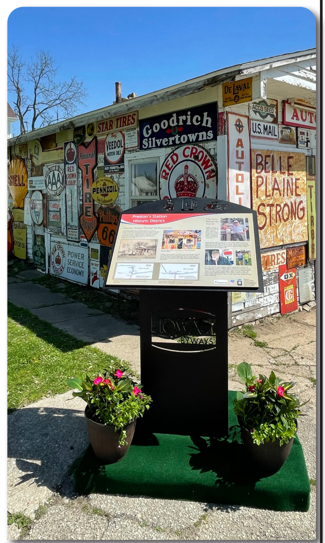
"Preston Station Unveiling" Page 4

"President's Corner" continued on page 3