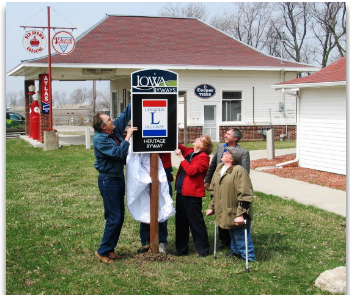
Back When The Original IDOT Lincoln Highway Heritage Byway Signs Were Installed.

Word seemed to spread quickly! We thank you for all of the support the Lincoln Highway Association and the Iowa chapter have given the Lincoln Highway Heritage Byway over the years.