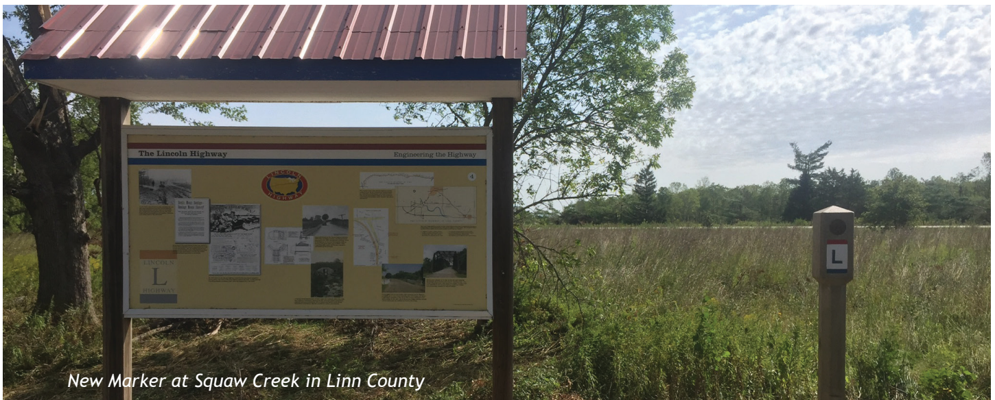
New Marker at Squaw Creek in Linn County

Here is to a new year in 2021 and all that it brings to the Lincoln Highway!