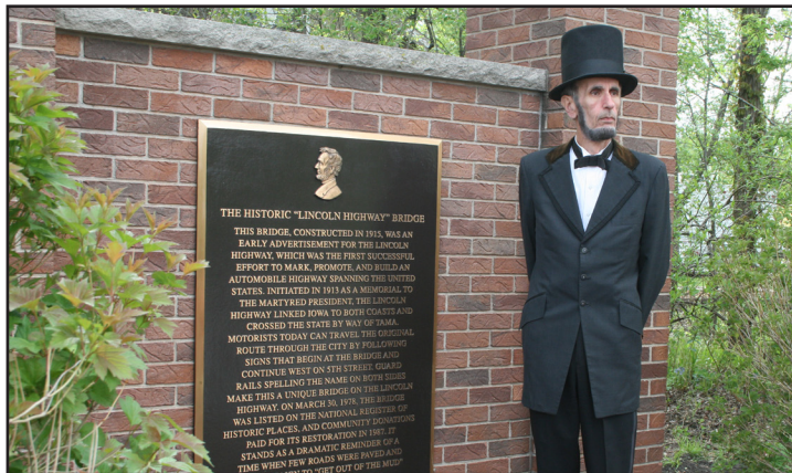
Tama Lincoln Highway Bridge Park Memorial

On Friday August 14th and Saturday August 15th, we will hold our annual fundraiser, Lincoln Highway Buy-Way Yard