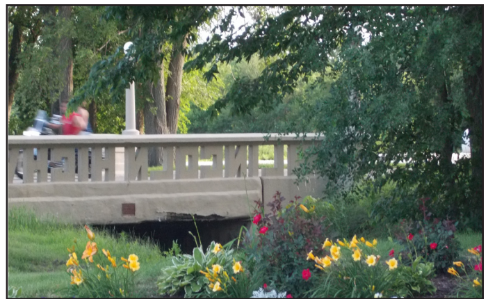
The Lincoln Highway Bridge and Friendship Garden in Tama.