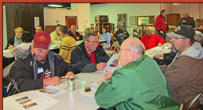
The first two Lincoln Highway Heritage Byway Corridor Management Plan public meetings were held in February in State Center (bottom) and Jefferson (top). Several additional meetings will be held all across the state this spring.

For more information, visit belleplaineeventsplanner.weebly.com . Reservations are required; call 319-434-2079 or e-mail belleplaineeventsplanner@gmail.com . Proceeds go to restore Belle Plaine's historic Herring Hotel and benefit scholarships for lifelong learners.