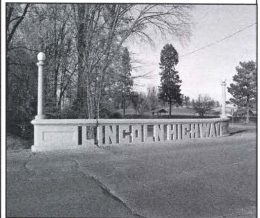
Lincoln Highway Bridge in Tama

For more information about the Byway or the photography contest, please visit us at www.prrcd.org/lincolnhighwayheritagebyway or on Facebook.