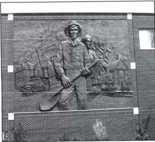
Brick Mural at Belle Plaine Museum

On May 2nd a dedication to the Legacy of the Belle Plaine Area was held at the Belle Plaine Area Museum to commemorate the brick mural that