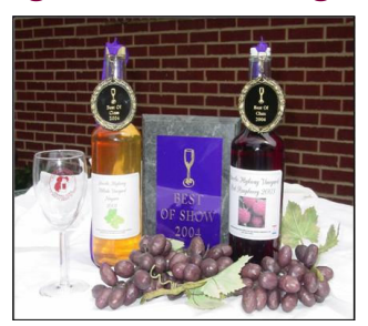
The Newsletter of the Iowa Lincoln Highway Association Summer 2004 . . . . . . Volume 9 Issue 2