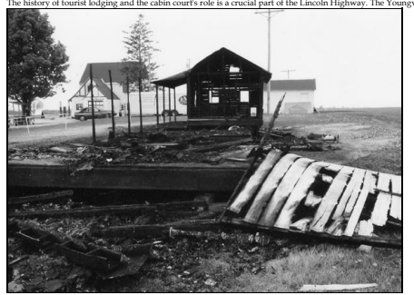
The mandate to locate, preserve, and protect the last vestiges of Lincoln Highway cabin courts is being addressed to varying degrees in all of Iowa's Lincoln Highway counties, and the Youngville site could help to unify these efforts

There are two questions that are inevitably addressed at any Lincoln Highway gathering. The first is usually a spirited discussion of the route of the original Lincoln Highway, and the second "Where were those old cabins? What ever happened to them?"