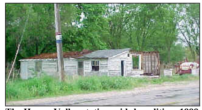
The Happy Valley station mid-demolition, 1999.

There was very little traffic from points east, not the amount of interstate traffic you would expect along the country's only transcontinental highway. The big truck traffic consisted mainly of DeKalb seed corn trucks. The trucks were regulars at the pumps and the drivers frequented the lunch counter. During a previous visit, Will told of how the drivers would fill up, come in and have a sandwich. The highway traffic was so light that leaving the truck parked at the pumps during the lunch break did not interfere with business.