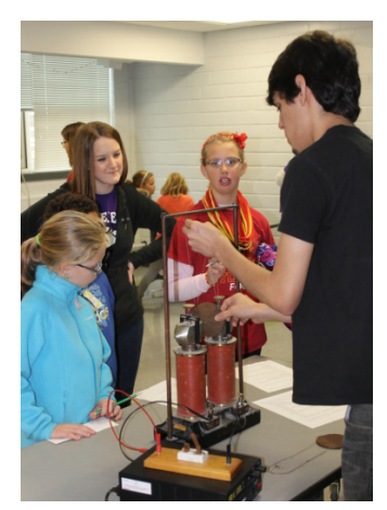
ISU Physics Club teaching the Meeker students about magnetic force.

Kids on the Byway (KOTB) is a Department of Natural Resources - Resource Enhancement and Protection (DNR-REAP) funded program that offers lowa elementary school students authentic learning experiences that can be found with the abundance of resources and experts along the Lincoln Highway Heritage Byway.