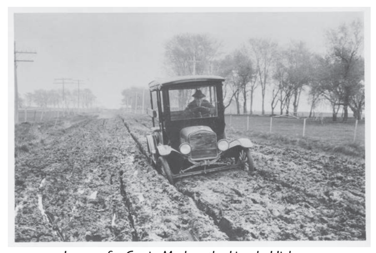
Image of a Car in Mud on the Lincoln Highway

The Iowa State Highway Commission (ISHC), forerunner of the Iowa DOT, became a state governmental department in 1913. From 1904 to 1913 it had been only an advisory body. However, by 1913, it was clear that if Iowa was going to take advantage of the motor age in personal travel and mechanized farming, we needed a group working full time to improve our roads and bridges. (Read more at http://www.iowadot.gov/about/organizationalhistory.htm)