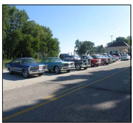
At Reed/Niland Corners in Colo