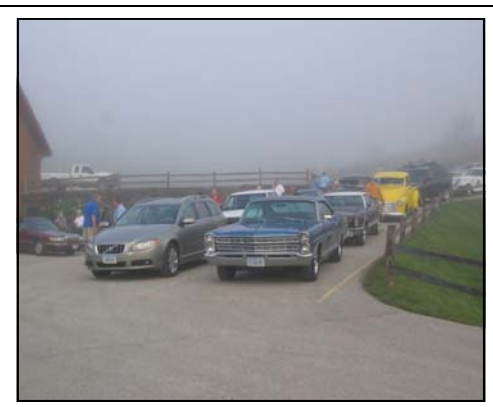
Start of The Tour- Harrison County