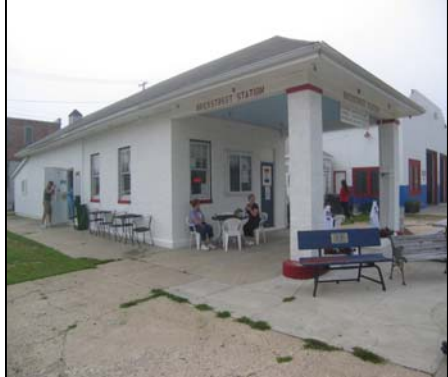
Brickstreet Station in Woodbine