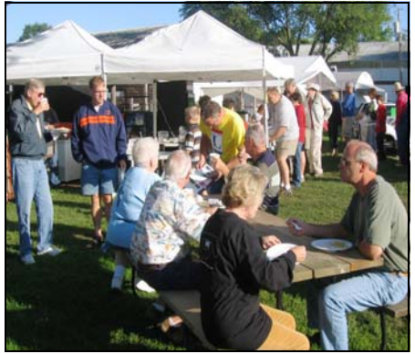
Breakfast in Nevada